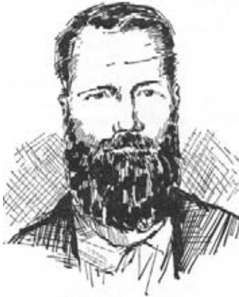
Henry Berry Lowry