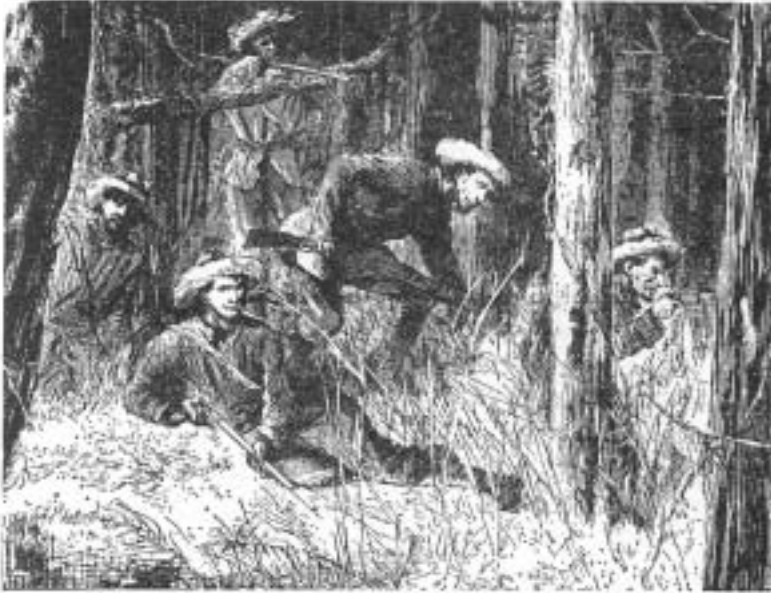
Henry Berry Lowry and His Gang in the Swamp

servatives lost control of the legal means to inflict violence, they shifted easily into extralegal means. A law and order position meant that Republicans had positioned themselves to be equally opposed to any kinds of popular rebellion or direct action, or for that matter Black or Brown self-defense. Locally, however, the Party's base constituency was overwhelmingly supportive of the popular vengeance and collective theft represented by the Lowry gang, and so the Party was conflicted.