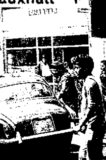
1976: Residents of Southall riot to protest the murder of Gurdeep Singh Chaggar. Despite the presence of the influential IWA (Southall), the youth went on to form alternative organizations that believed in militant direct action.